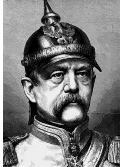
Otto Von Bismarck

Bismarck took full control of the country, ruling under a policy known as realpolitik , meaning "the politics of reality." Stating that the decisions of the day would be decided not by speeches but rather by " blood and iron ," Bismarck practiced his realpolitik theory and embarked on a campaign of German unification.