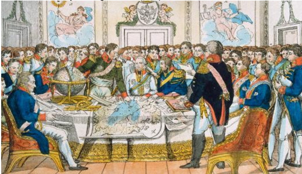
The Congress of Vienna

Former absolute monarchs who were defeated by Napoleon met after his exile in 1815 at the Congress of Vienna . There they reestablished the balance of power in Europe by reinstating absolute monarchies. Also, all lands taken by Napoleon were returned to the nations to which they belonged before Napoleon's rule.