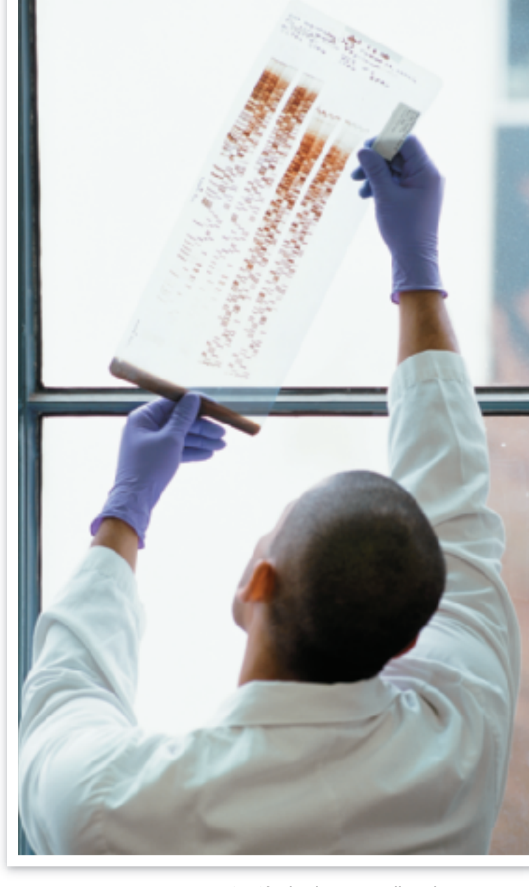
Scientific developments allow the use of DNA evidence to connect an offender to a crime. How else may DNA evidence be used?

A person who reasonably believes there is imminent danger of bodily harm can use a reasonable amount of force in self-defense. However, a person cannot use more force than appears to be necessary.