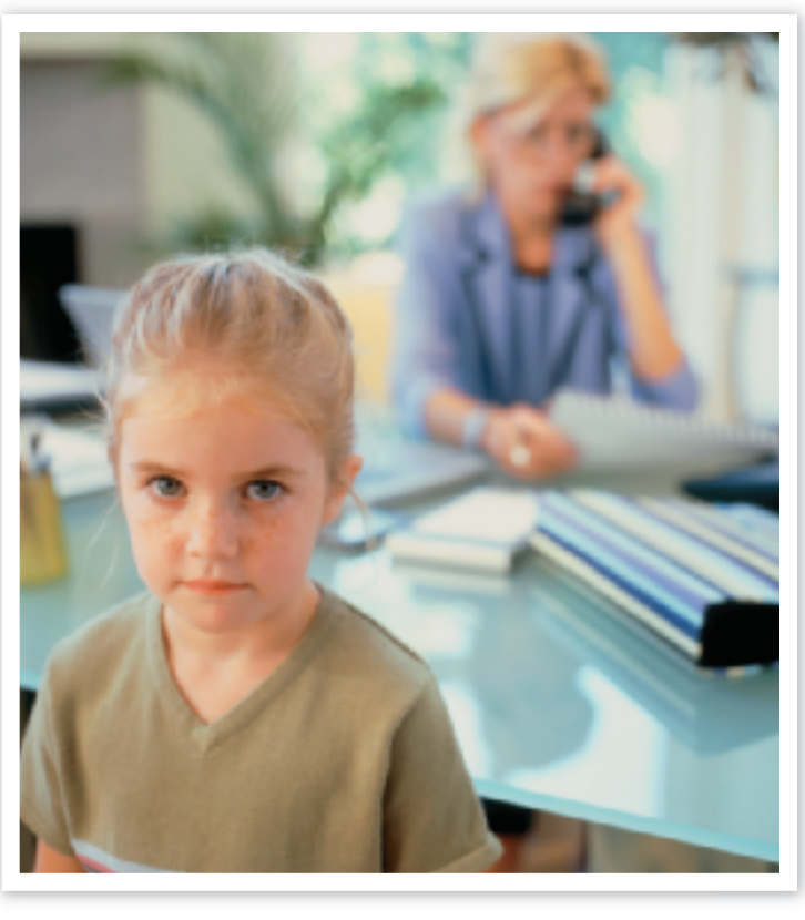
The defense of infancy rests on the defendant's lack of criminal responsibility. How does this defense vary among states?

result of trying a child for a heinous crime as an adult and allowing a sentence of up to life in prison. In Florida, for instance, a 12-year-old boy was tried as an adult for the death of a 6-year-old girl that resulted from the boy using a wrestling move on her that he saw on television. He received a mandatory life sentence under a "tough on crime" law that was passed in the mid-1990s.