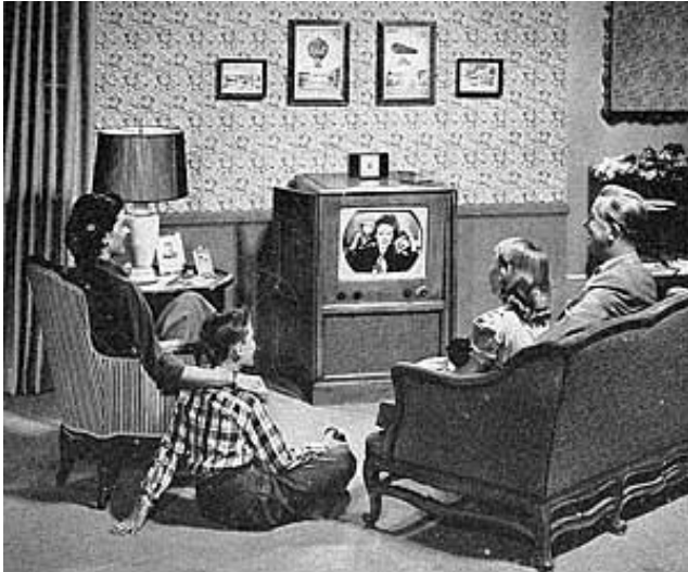
A family gathers around the living room TV set in the late 1940s or early 1950s.

Civil Rights Movements, the Vietnam War and the Iraqi Wars to enter our lives on a daily basis. This access has fostered greater empathy and understanding in the general public for events. Satellites have increased worldwide communication. Globalization has forever linked countries and allowed us to broadcast events from anywhere. Satellites are used today for television access, radios, internet and various other parts of pop culture.