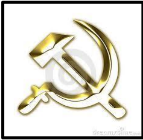
Soviet Hammer and Sickle

equally to all citizens. Land was arranged in communes shared by citizens. This practice of owning property as a group was called collectivization . This became the focus of society in the Soviet Union.